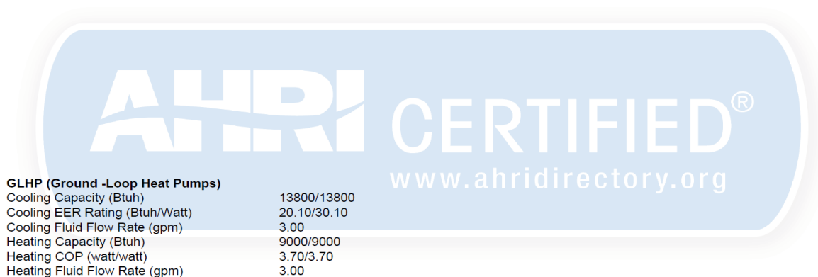
Figure 4: Geothermal AHRI Certificate

If equipment is being installed in non-standard temperatures, option B should be followed to calculate sizing ratio. The participating contractor will be required to submit manufacturer performance data at the specific design conditions. The AHRI method will apply in most circumstances.